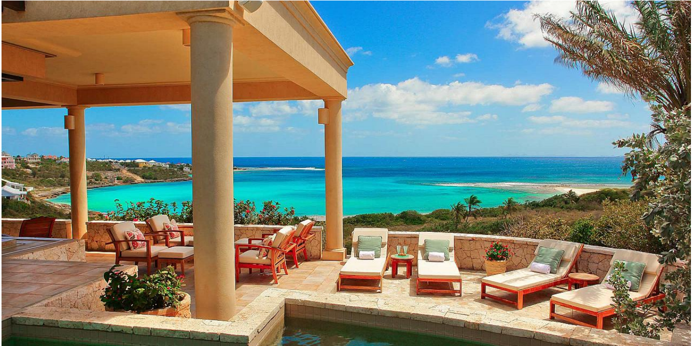
BIRD OF PARADISE , 4 - 5 BEDROOMS , 4.5 BATHROOMS