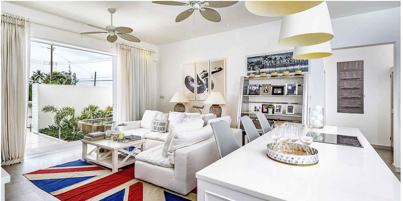
FOOTPRINTS COTTAGE , 1 - 3 BEDROOMS , 3 BATHROOMS