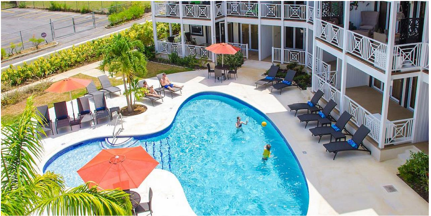
LANTANA 14 , 1 BEDROOMS , 1 BATHROOMS PRICE : $225,000 USD